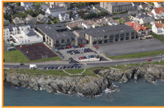
St. David's has to charge for water usage this year